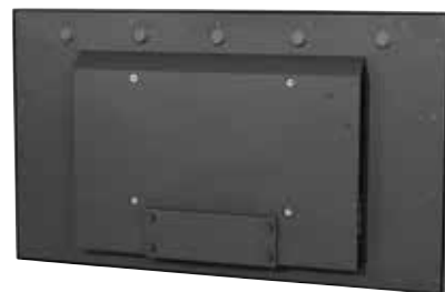
Sealed cable entry helps prevent water and debris from getting inside