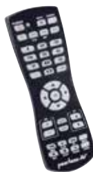
Waterproof Universal Remote

Aluminum construction materials provide the ultimate defense against weather and discoloration